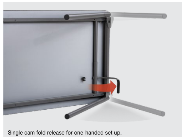
Single cam fold release for one-handed set up.