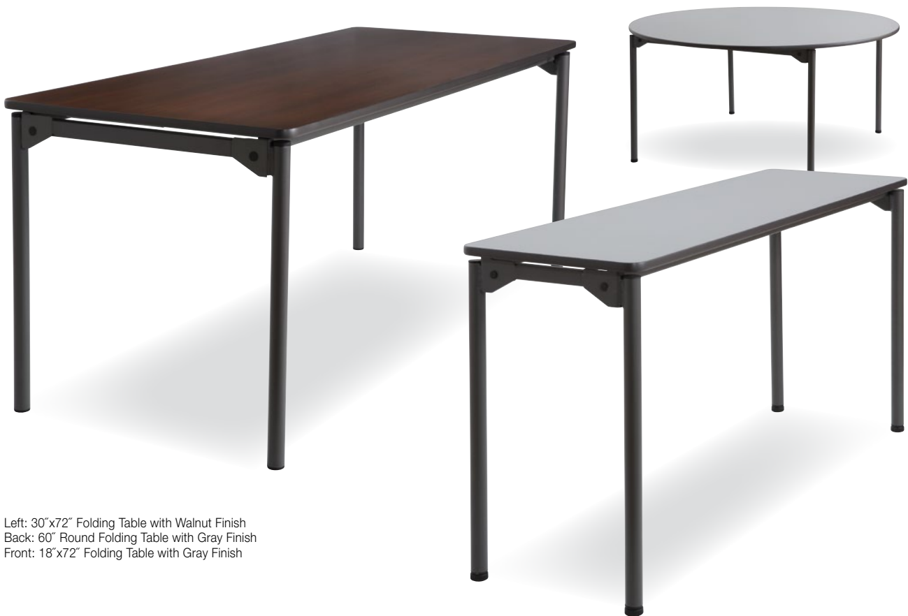
Left: 30"x72" Folding Table with Walnut Finish Back: 60" Round Folding Table with Gray Finish Front: 18"x72" Folding Table with Gray Finish

Extreme quality in a table that meets every commercial and institutional need. Innovative open corner leg design eliminates the need for a cross bar – providing maximum leg room and seating capacity. Single cam, one-hand leg fold release, saves set-up time.